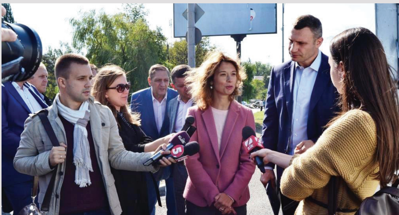
CoST Ukraine engages the media

CoST results speak for themselves: from disclosing data on over 6,000 infrastructure projects in 2017 (a two-fold increase on 2016); to cancelling a contract for rebuilding Guatemala's Belize Bridge which saved the miss-appropriation of $(US) 5 million; to repairing a defective bridge in Ukraine; to stopping environmental pollution on a construction site in Honduras; to a $(US) 3.5 million saving on upgrading Ethiopia's Gindebir to Gobensa Road, which now provides a lifeline to hospitals, schools and the local economy.