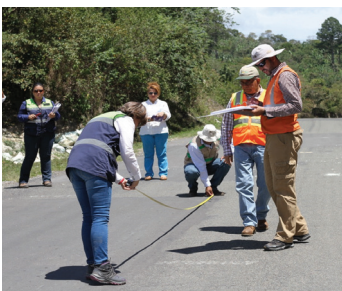
Citizens in Honduras help monitor road projects

Since joining CoST in 2014, Honduras has developed a highly innovative approach to implementing CoST based on the OGP principles.