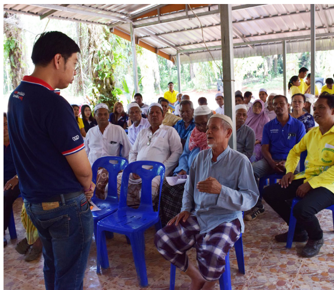
Assurance team members speak to the community in Krabi, Thailand

“CoST set a standard for communication and dialogue with project owners and communities”