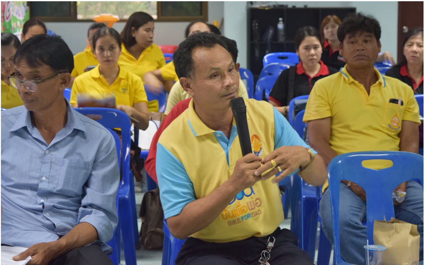
A meeting in Phetchabun, Thailand

When Thailand joined CoST in 2015, the country was led by a military government. Within this context, CoST Thailand's public forums are a significant step towards greater dialogue between communities and decision-makers. Furthermore, CoST is generating a set of transferrable skills in public participation which have the potential to spark similar local approaches, and have created a space for transparency, accountability and participation.