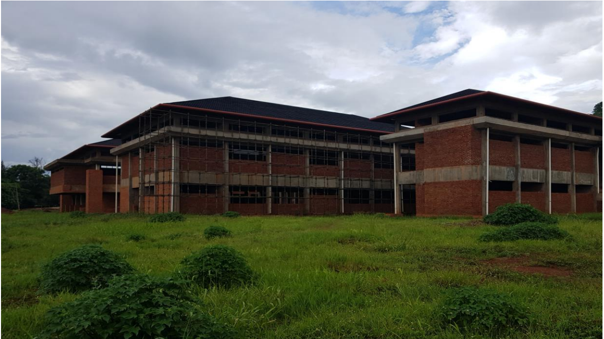
Picture 4.3.1 – New Teaching Block (Incomplete) as at January 16 th 2018