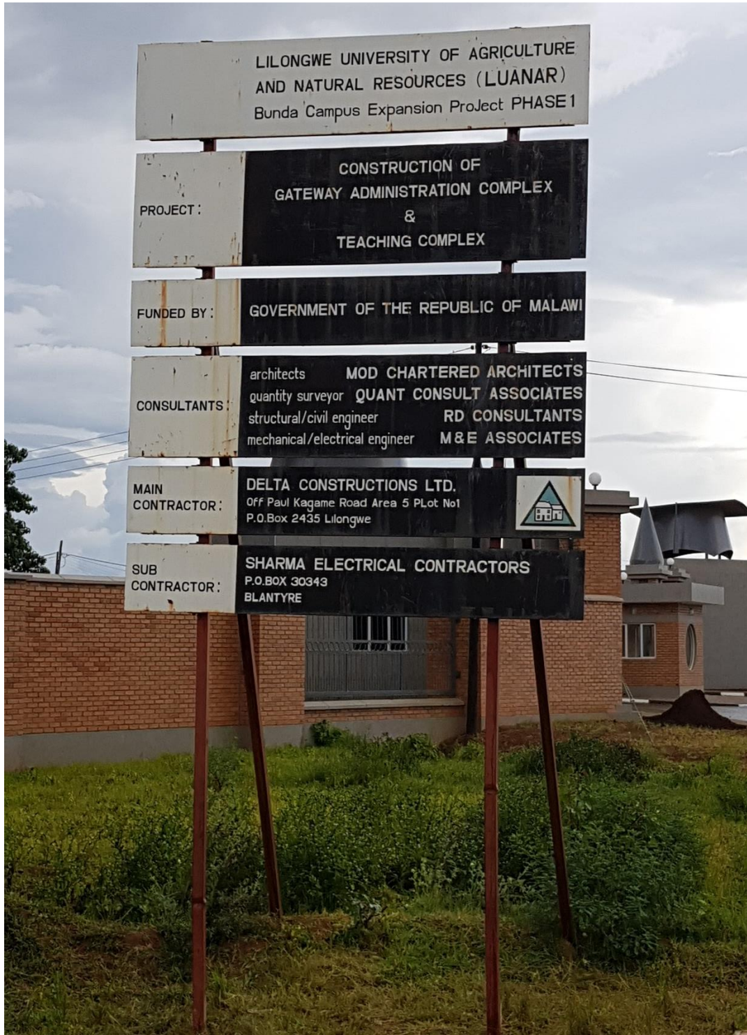
Picture 4.3.6 – Project Sign Board – Part of Project Disclosure to the Public