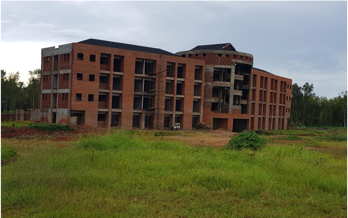
Picture 4.3.4 - Gateway Administration Block Imposing View