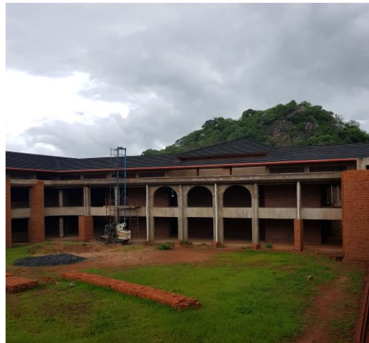
Picture 4.3.3 - Courtyard