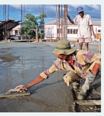
"...a means to capture postproject cost and performance information and improve access to international data.."

"The adoption of an alternative design recommended by the Ethiopian Assurance Team is expected to lead to a cost saving of 40m birr or $2.3m."