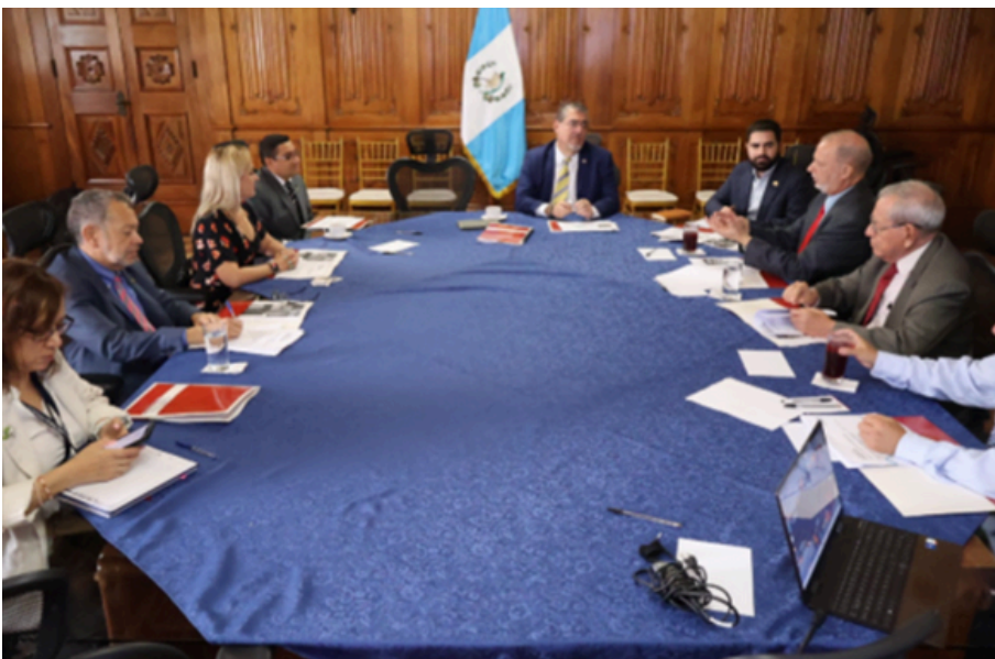
Meeting between the Constitutional President of the Republic of Guatemala, members of the Multistakeholder group and the National Secretariat of CoST Guatemala, held on May 21st, 2024.

The most significant reform the MSG and Local Secretariat influenced was the Ministry of Public Finance Resolution (2014). This mandates the publication of 31 of the 40 CoST Infrastructure Data Standard, data points on Guatecompras and two years later, it gained even more strength through a specific article that was included in the Reforms to the State Procurement Law. The article specified that procuring entities needed to comply with the CoST IDS, which must be reflected in their accountability reports. This would be funded by the Organic Budget Law further supporting good practice and efficient control in the contracting and execution of public works. This must be reflected in the accountability report of each entity in the country.