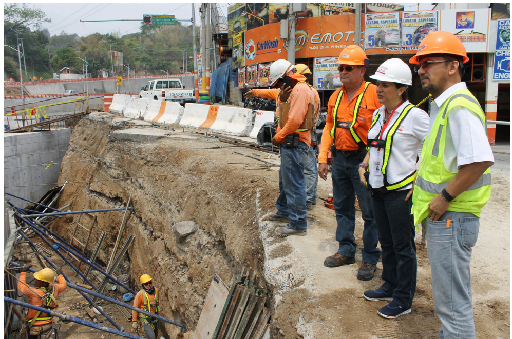
CoST Guatemala assurance visit

This infrastructure transparency story looks at how the CoST Guatemala Multi-Stakeholder Group (MSG) and the National Secretariat has despite the context, influenced reforms helping to institutionalize transparency into the sector enabling the publication of data on 40,736 infrastructure projects by over 300 procuring entities.