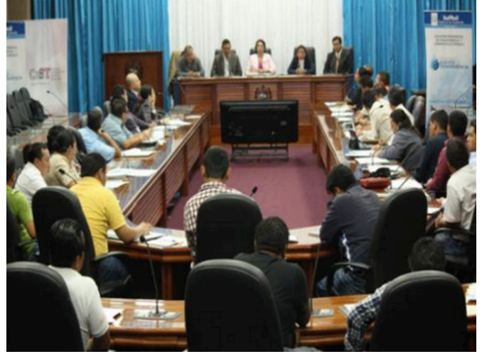
One of CoST Guatemala's training sessions

This includes university and community leaders, journalists, representatives of non-profit organizations, think tanks, the British Embassy and USAID and research centers.