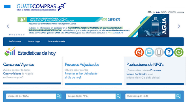
Screenshot of Guatecompras in 2024

The work of CoST Guatemala has also contributed to important changes in practice and behavior on how infrastructure projects are delivered. This has principally been achieved by independently reviewing 156 projects using the CoST assurance process including transport, education, and health sectors identifying gaps within the legal framework.