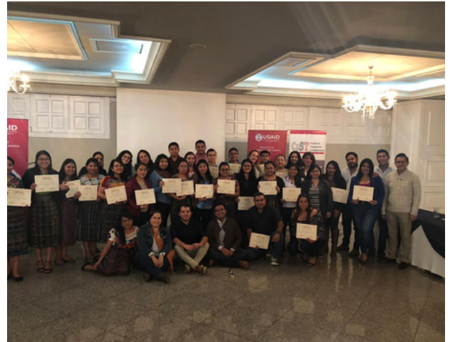
University students from CoST Guatemala's social audit programme

Looking ahead, CoST Guatemala will be using lessons from existing relationships to take on a more targeted sector approach to dialogue with other government departments on existing reforms. The member will also focus on establishing a better monitoring system for compliance with the CoST IDS with support from the Ministry of Public Finance and continue to advocate for greater transparency, participation and accountability in infrastructure in Guatemala.