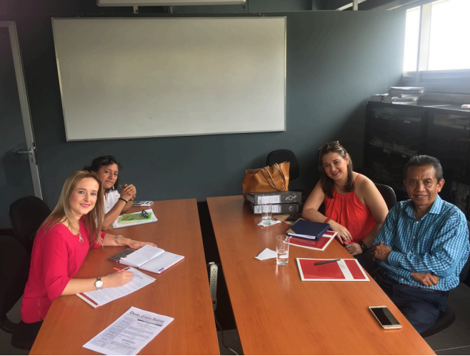
CoST Guatemala roundtable meeting